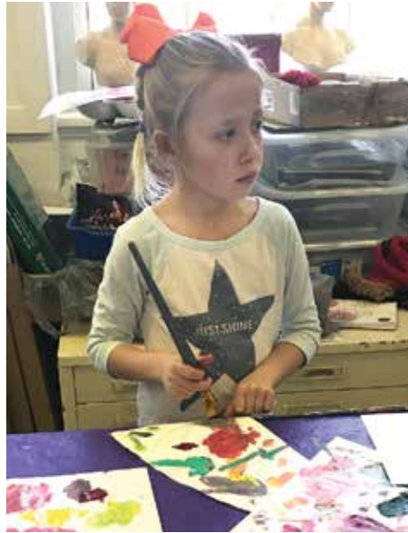
Painting at Maryland Hall