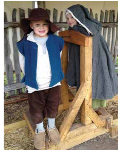
Experiencing colonial life at Historic London Town and Gardens