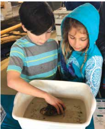
Activities at Annapolis Maritime Museum

Please remember the Four Rivers Heritage Area (legal name ALTSCHA, Inc.) in your charitable donations. Visit our website, www.fourriversheritage.org/support for details on how you can support the organization.