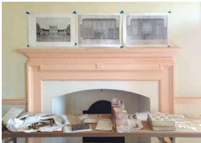
Brice House detail

May is Preservation Month! Four Rivers celebrates this month by acknowledging the hard work of our partners in undertaking capital improvement and preservation projects that will result in an enhanced heritage tourism experience in our area. These projects include: